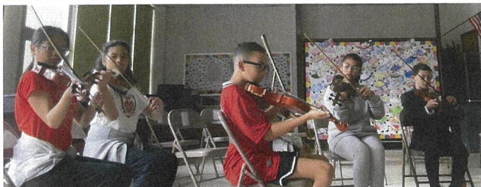
Primary and Intermediate instrumental violin students are engaged in learning notes and playing strings. Practice makes perfect!