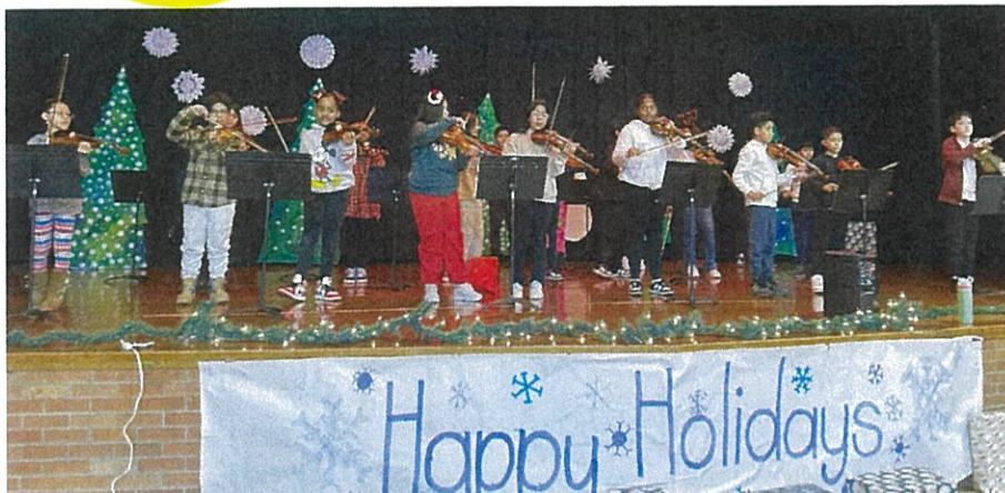
Instrumental violin students during our evening Winter Holiday Concert